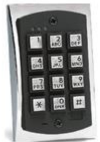
Optional keypad requires code to activate controls