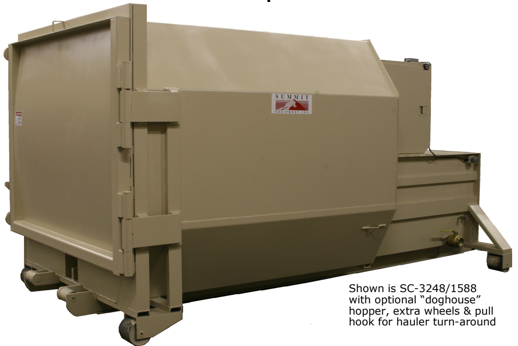
Shown is SC-3248/1588 with optional "doghouse" hopper, extra wheels & pull hook for hauler turn-around

The SC-3248 and SC-4060 compactors are designed to clean up your waste site by capturing and retaining waste, including liquids. At the same time, they reduce the number of times you have to empty, saving thousands of dollars all year long.